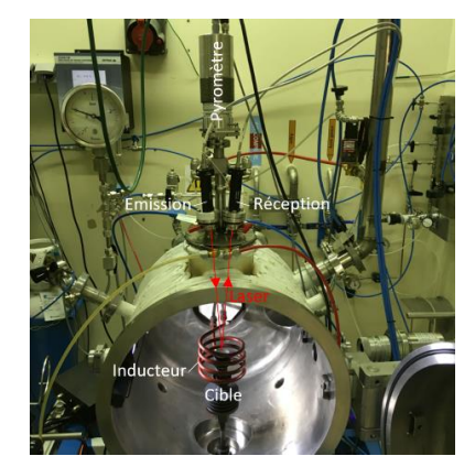
View of the pyroreflectometer test-bench for laser beam determination of temperature in the VITI facility