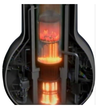
Application case : artist view of a nuclear severe accident

Successful work within the framework of this thesis will allow the student to acquire in-depth and transversal skills, in various fields relating to the metrological approach, instrumentation as well as high temperature characterization methods. Beyond this thesis, he / she may apply for a position for a career in academic or industrial research in the fields of instrumentation and / or material characterization.